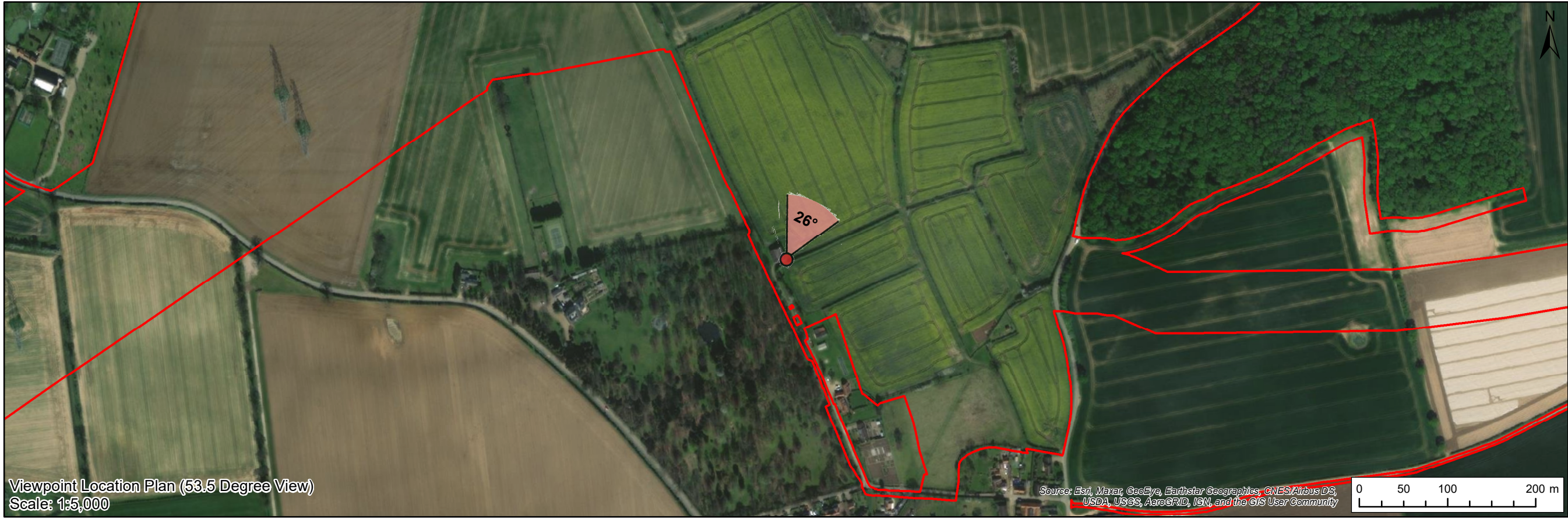
Viewpoint Location Plan (53.5 Degree View) Scale: 1:5,000